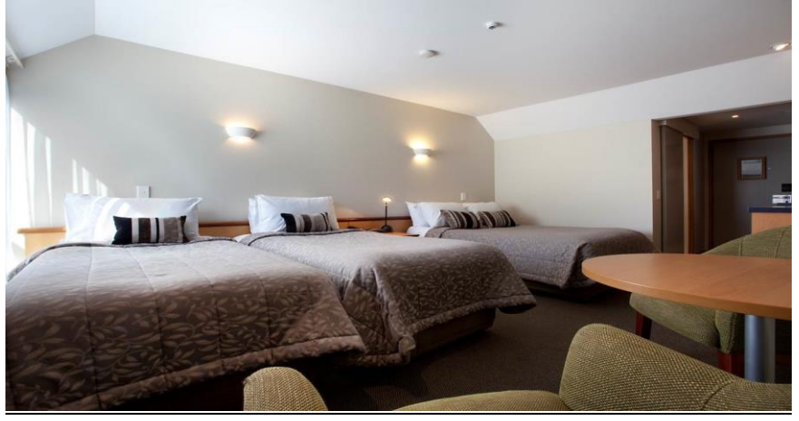
Standard Triple Room